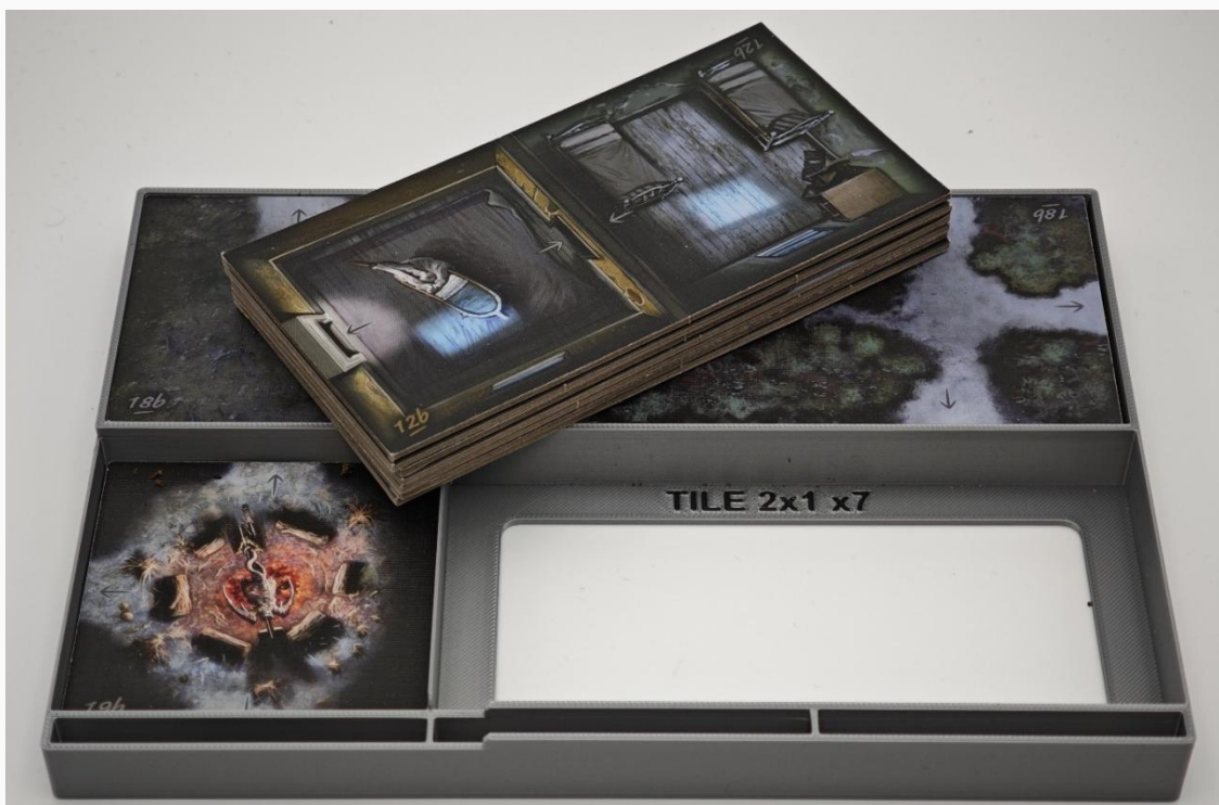
Box for double sided tiles sized 1x1, 2x1 a 3x1