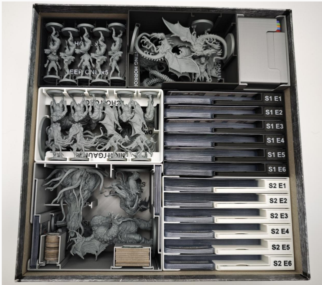
Layout in the game box (without tiles, game manuals)