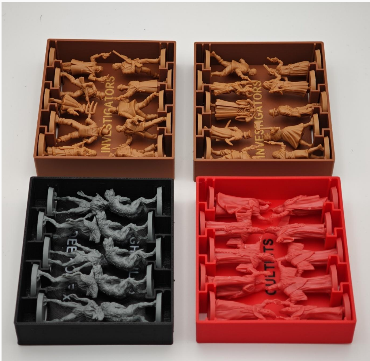
Boxes for investigators, cultists and small monsters from Season 1